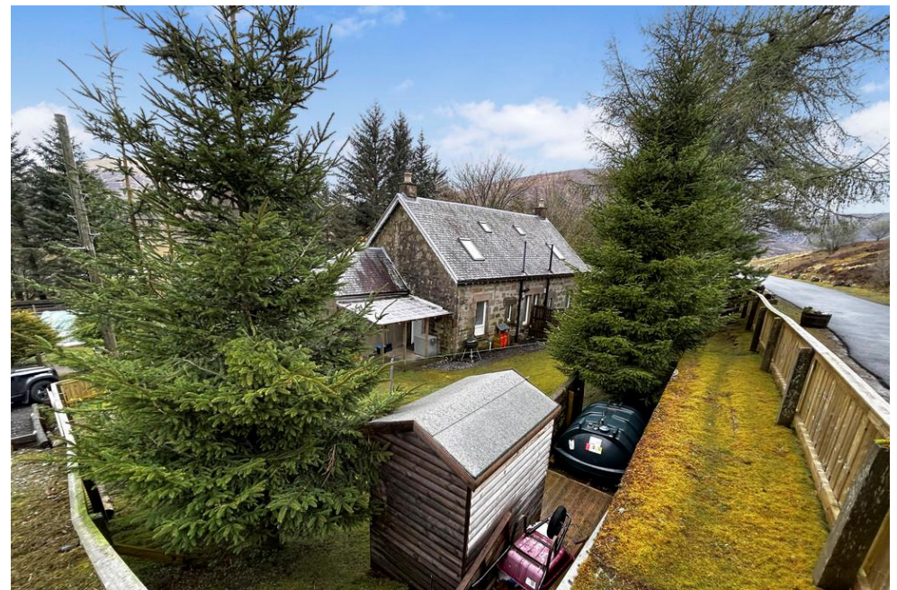
Next Home - 1 Station Cottages, Dalnaspidal, Pitlochry, PH18 5UJ