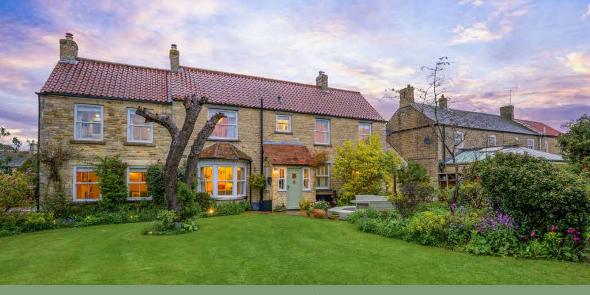
Roselea Cottage, 4 Corby Road, Swayfield, Grantham NG33 4LQ