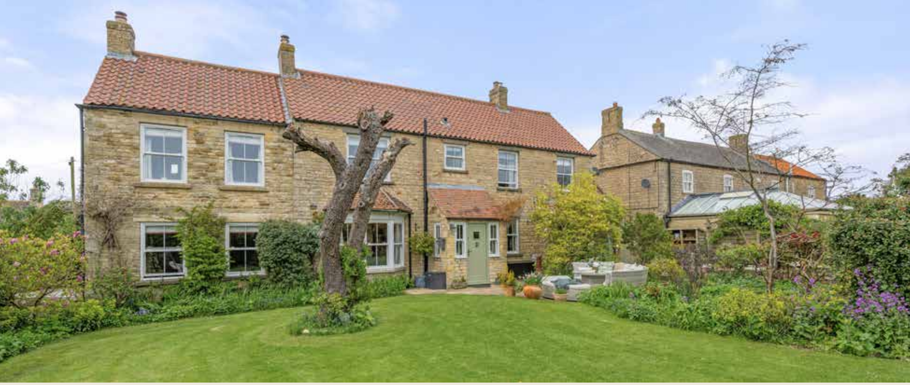
Nestled off Corby Road, in the rural village of Swayfield, discover a character home that offers versatility of living, at the enchantingly entitled Roselea Cottage.

Pull onto the gravel driveway, where mature A home renovated and reimagined by the hedging provides privacy and peace, and current owners, the home has been remodelled parking is available for four cars, alongside an to allow for light filled living, whilst a light EVC point.