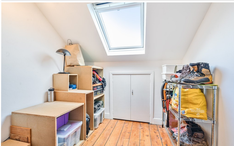
Bedroom 4 / Study