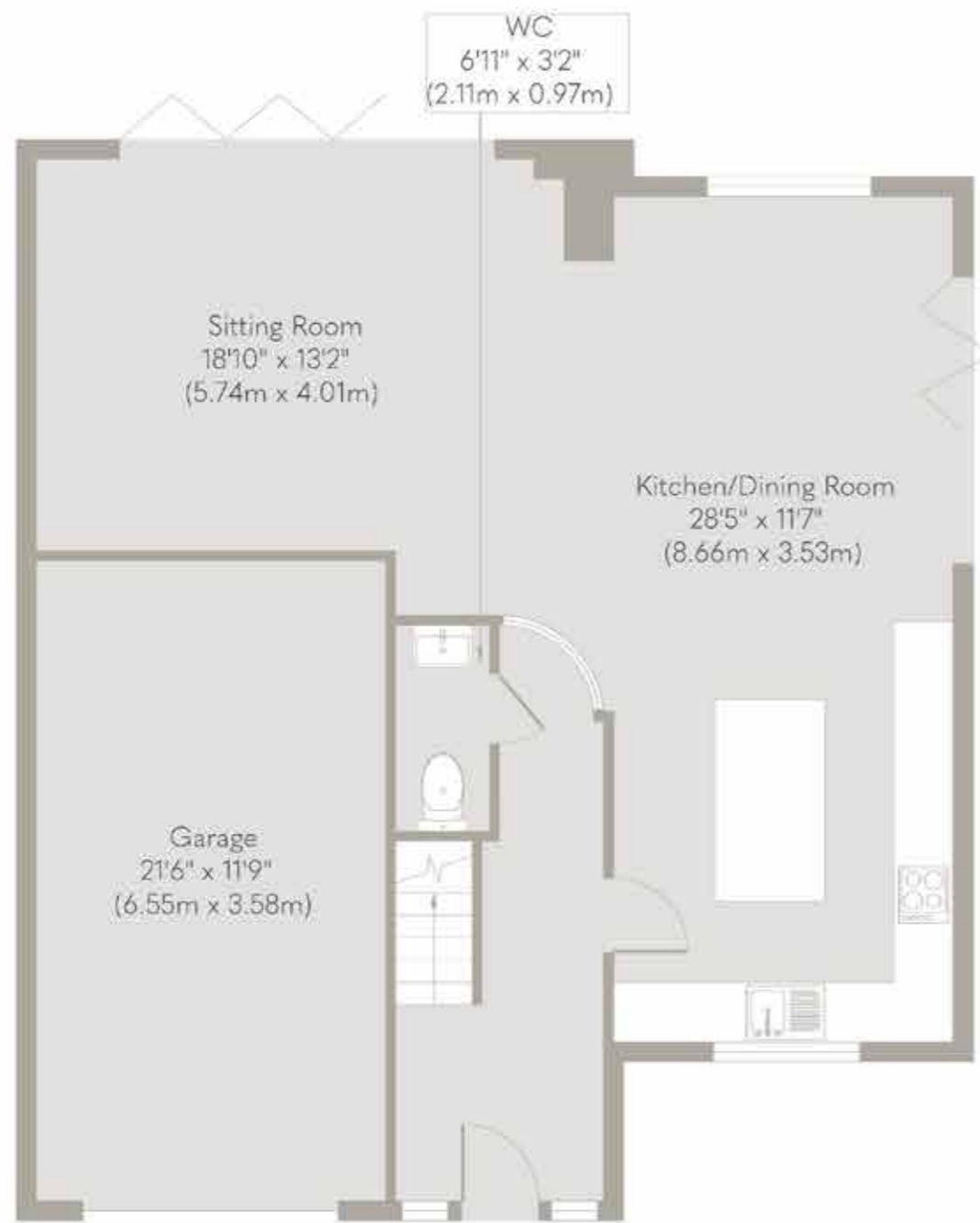
Ground Floor Approximate Floor Area 750 sq. ft (69.63 sq. m) Excluding garage