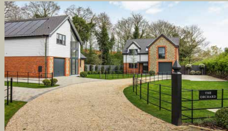
Homes at The Orchard

A brilliant location, exquisite properties waiting to be rediscovered and a growing band of entrepreneurial businesses, Fakenham is enjoying a renaissance and offers a superb place to call home.