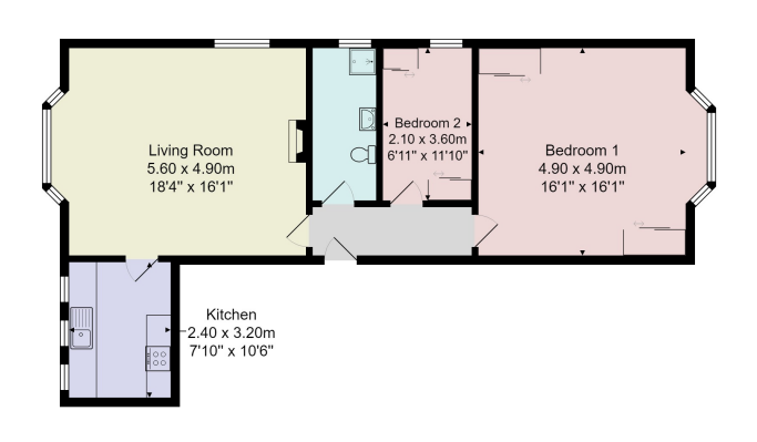
Total Area: 81.5 m² ... 877 ft² All measurements are approximate and for display purposes only. No liability is accepted by either the agency or Box Property Solutions Ltd as to the exact measurements of the rooms. Box Property Solutions Ltd retains the copyright on this plan and allows agents to use it with agreed permission.