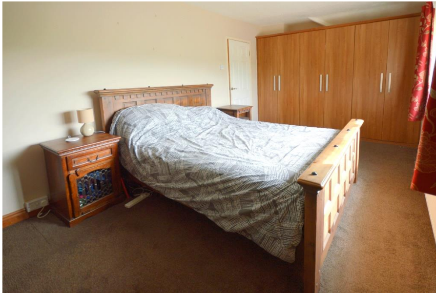
Wolds View from the Main Bedroom