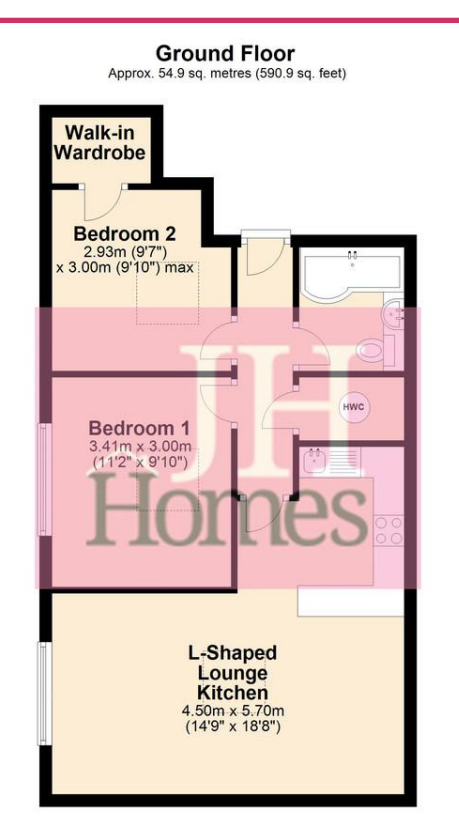
Total area: approx. 54.9 sq. metres (590.9 sq. feet)