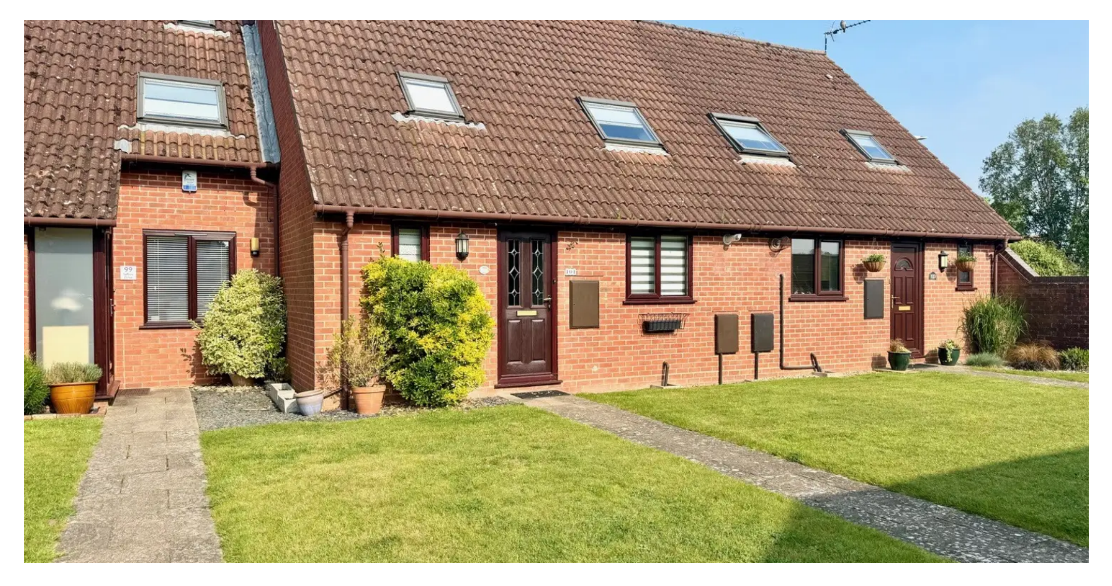
101 Saffron Drive, Christchurch Christchurch