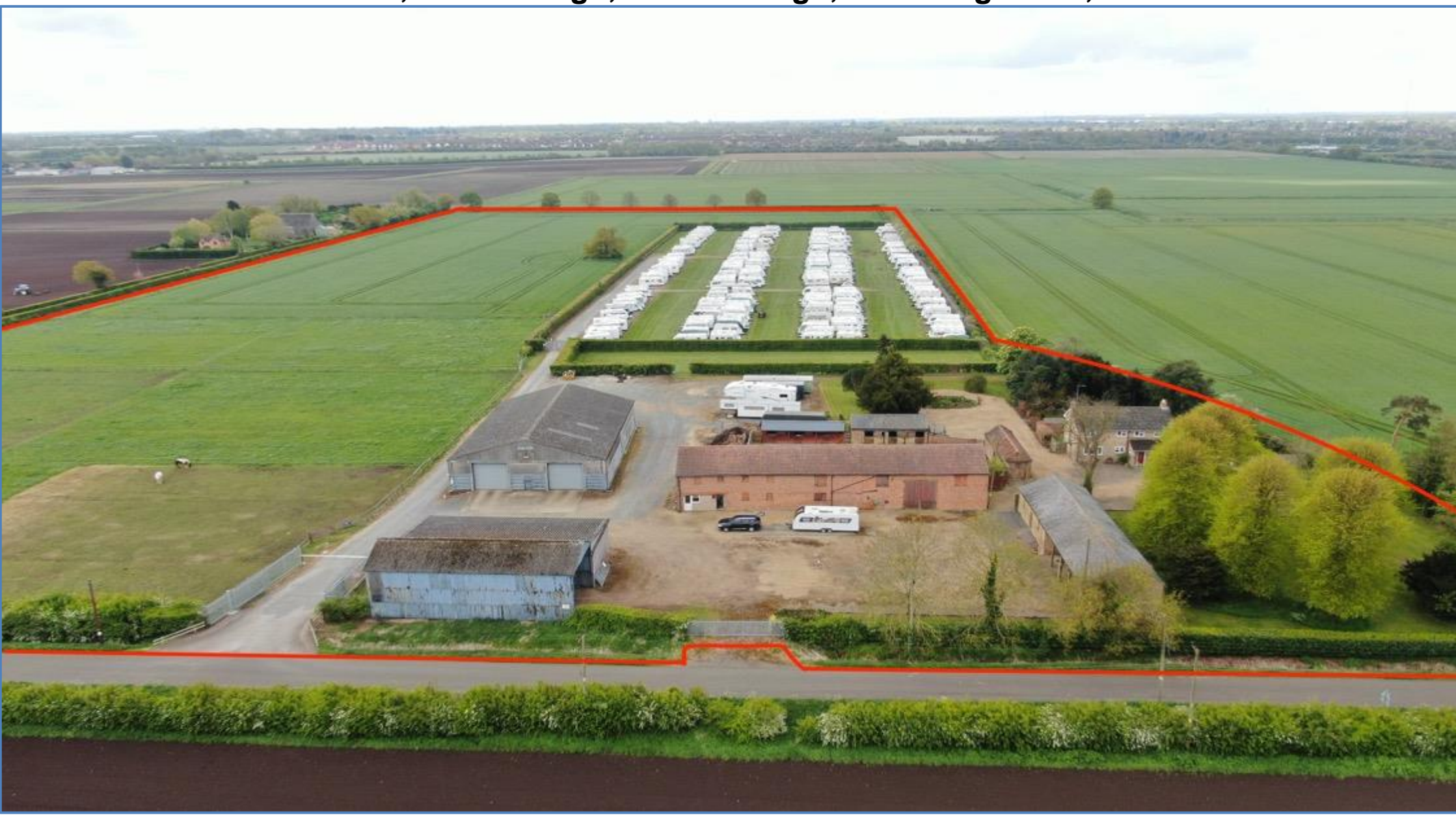
FOR SALE - Guide Price £1,550,000