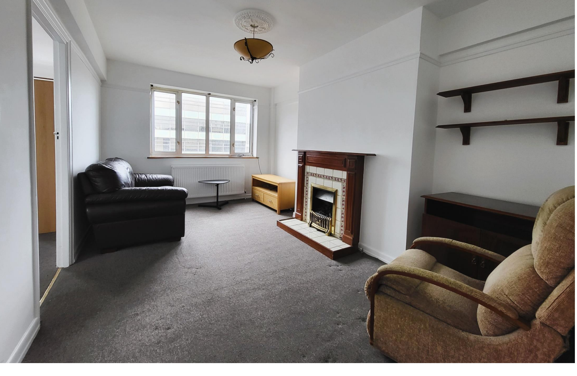
Colman court, SW18 4NZ