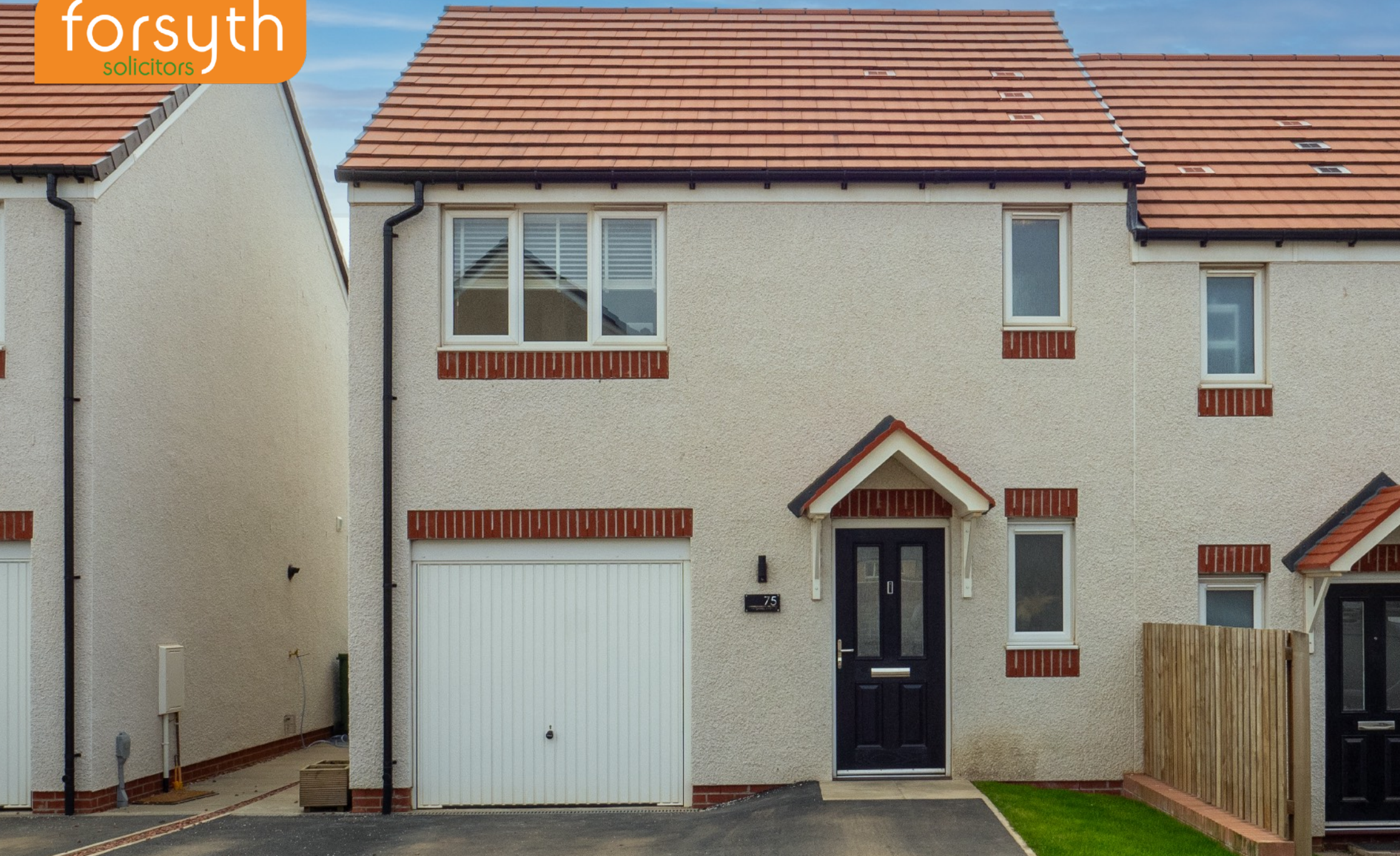
75 Craighall Avenue Musselburgh EH21 8FP