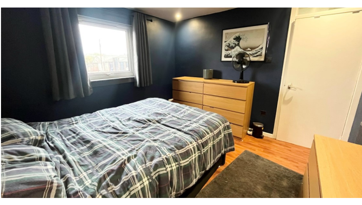
38 Pumpherston Road