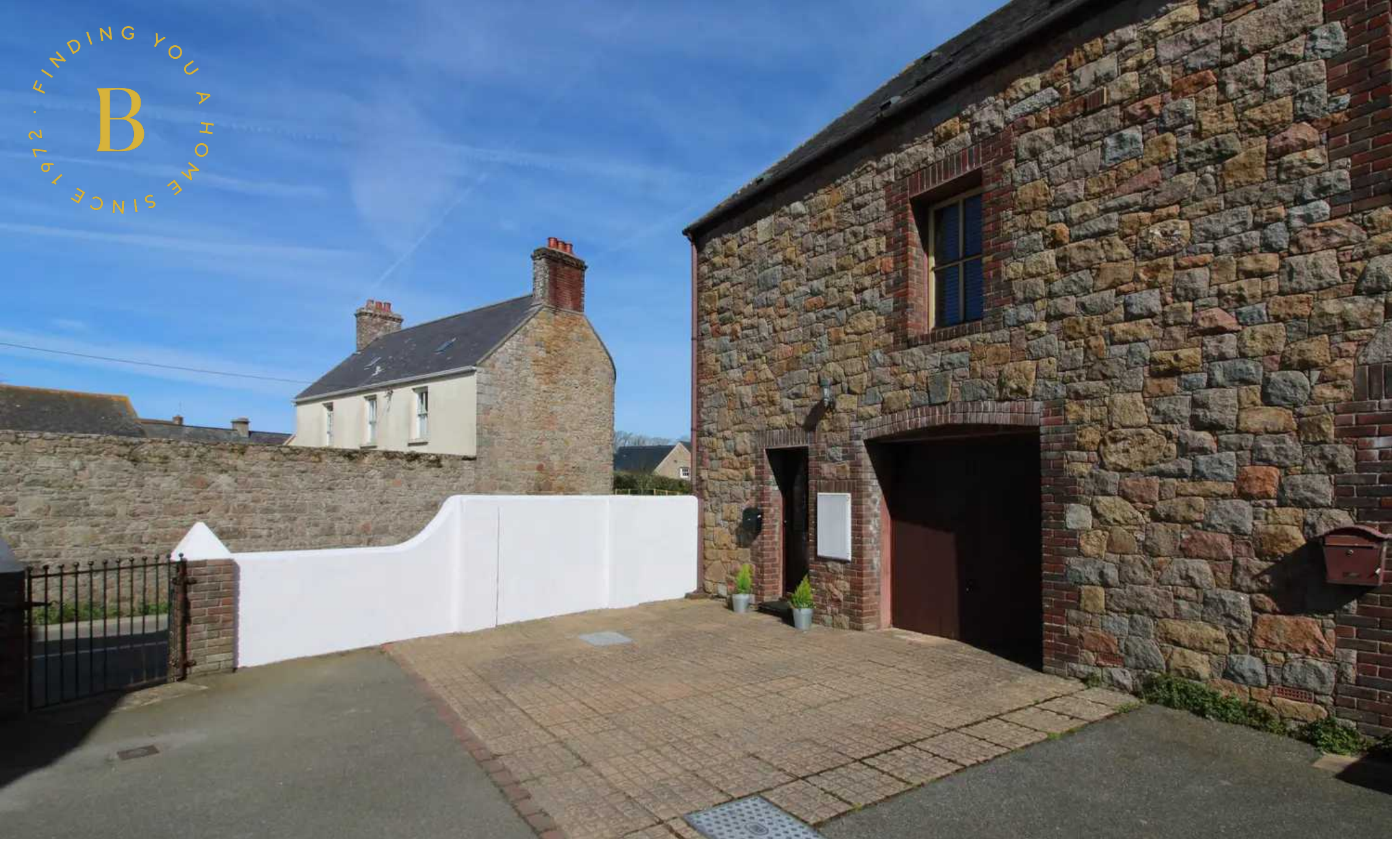
4 La Place Du Puits, La Rue De La Capelle, St. Ouen £2,500 PCM