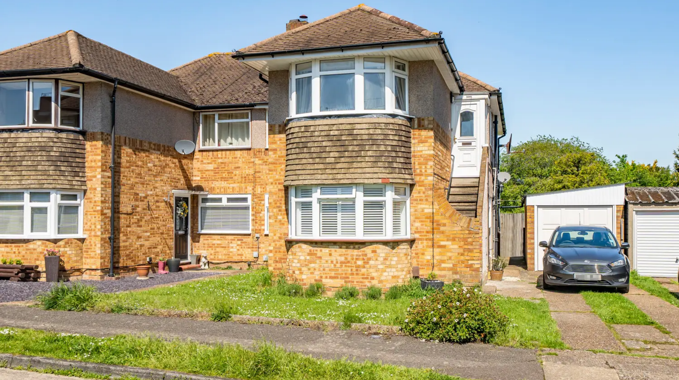
38 Willis Close, Epsom Epsom