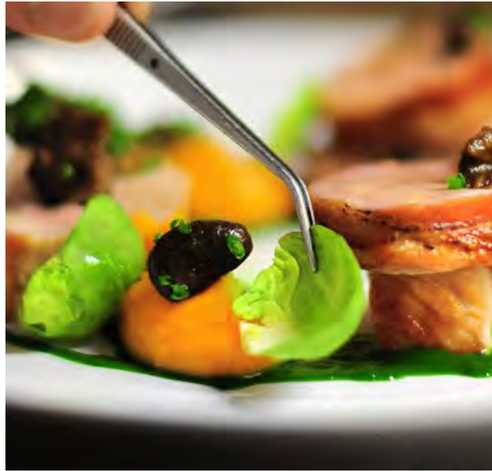
PIED A TERRE