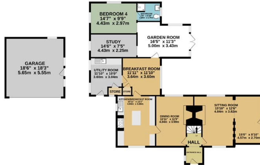
GROUND FLOOR 1755 sq.ft. (163.1 sq.m.) approx.