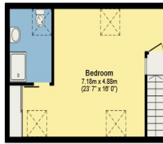
First Floor Apartment