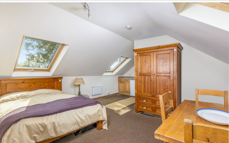
First Floor Apartment