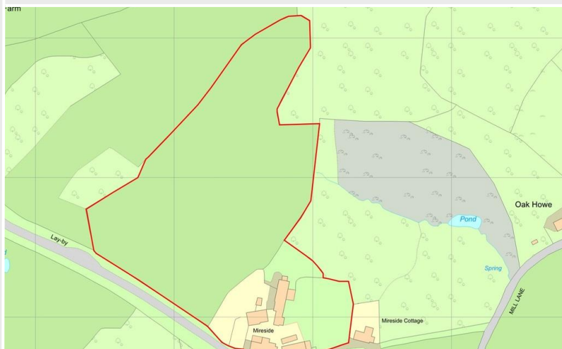
Ordnance Survey Ref: 01161877