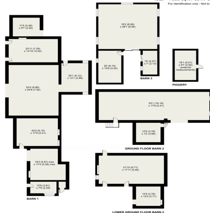
LOWER GROUND FLOOR BARN 2

Floor plan produced in accordance with RICS Property Measurement Standards incorporating International Property Measurement Standards (IPMS2 Residential). © ricscom 2024. Produced for Hackney & Leigh. REF: 1110799