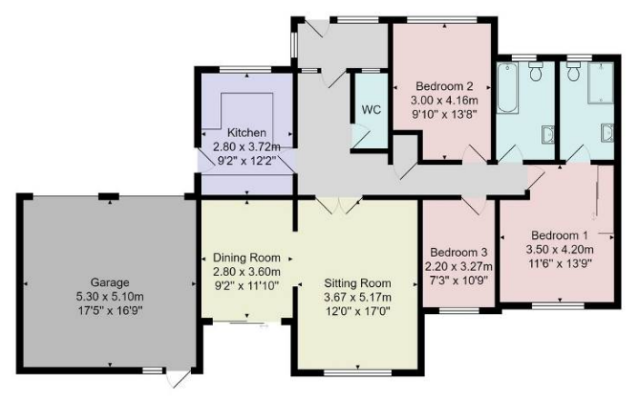
Total Area: 135.9 m² ... 1463 ft² All measurements are approximate and for display purposes only. No liability is accepted by either the agency or Box Property Solutions Ltd as to the exact measurements of the rooms. Box Property Solutions Ltd retains the copyright on this plan and allows agents to use it with agreed permission.