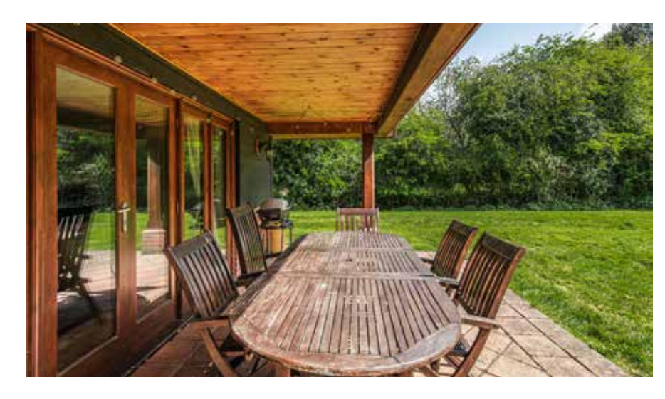
"The covered patio is perfect for summer's days." SOWERBYS

Life moves at a leisurely pace in Holt, and there are plenty of places to idle over a coffee or bite to eat. Believed to be the oldest house in town, Byfords deli and café is a central landmark and fabulous place to stop and watch the world go by.