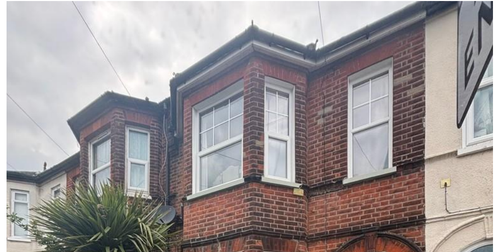
Nelson Road Harwich,

Harwich Office 147 High Street Harwich Essex CO12 3AX Tel: (01255) 506655