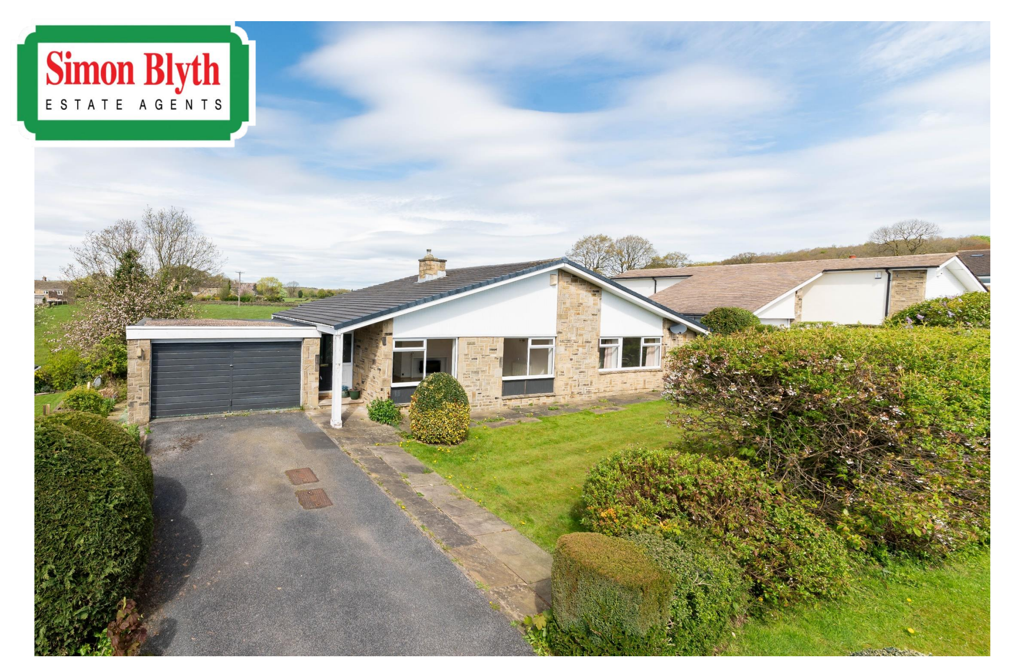
PARK AVENUE, SHELLEY, HD8 8JG