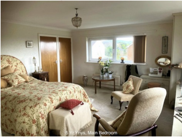
5 Yr Ynys, Main Bedroom