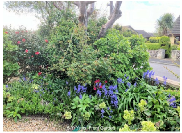
5 Yr Ynys, Front Garden