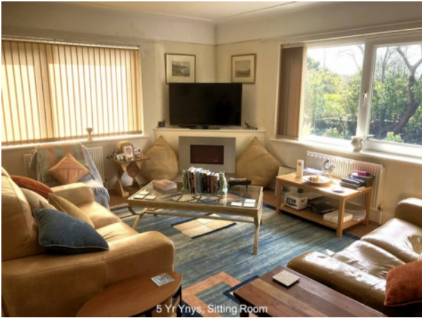
5 Yr Ynys, Sitting Room