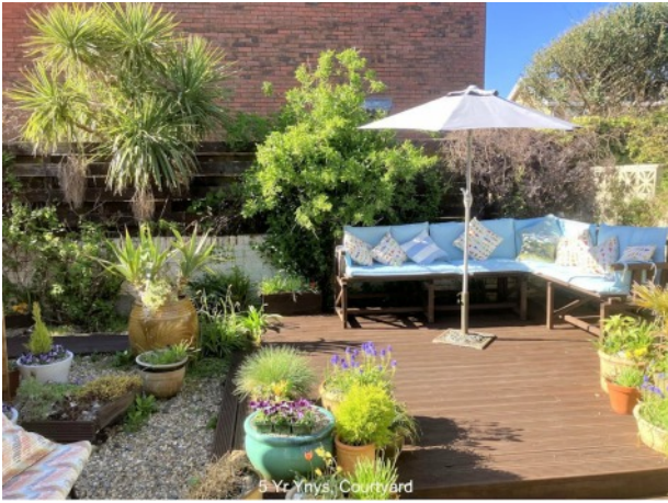
5 Yr Ynys, Courtyard