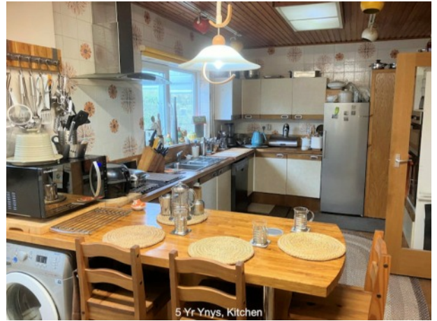
5 Yr Ynys, Kitchen