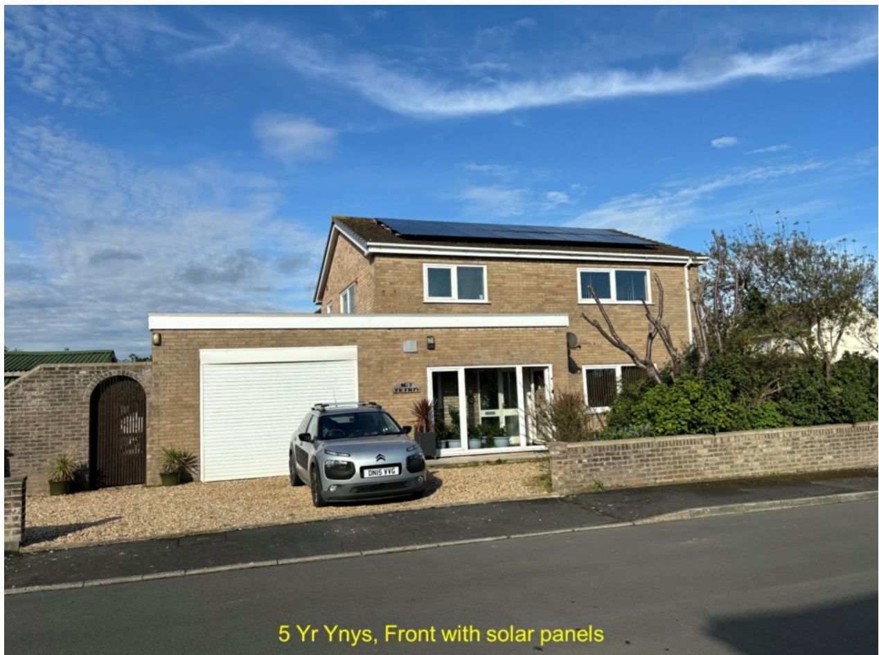
5 Yr Ynys, Front with solar panels

Spacious detached 3 bedroom, 2 bathroom house situated on this exclusive estate Close to all amenities including promenade and beach Maturely planted garden, parking for several vehicles Integral garage.