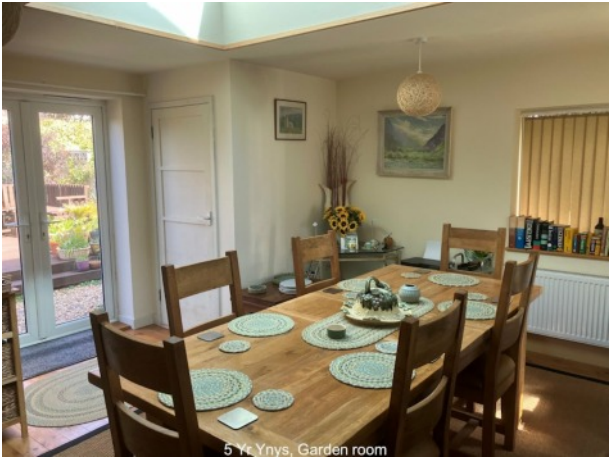
5 Yr Ynys, Garden room