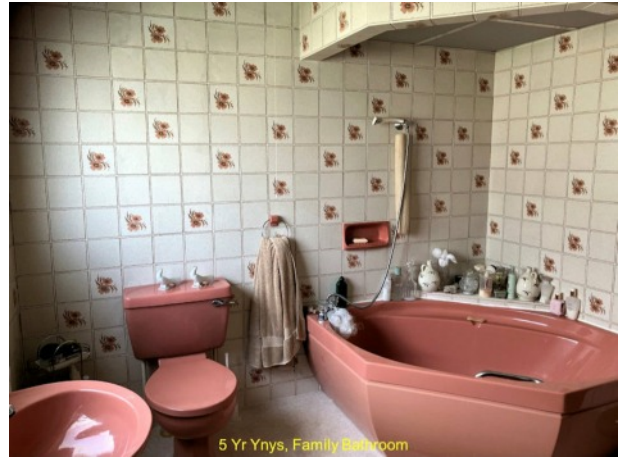
5 Yr Ynys, Family Bathroom