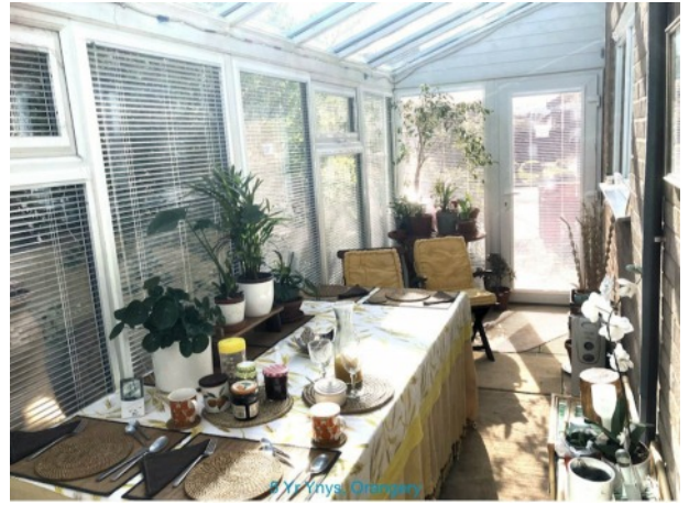
5 Yr Ynys, Sunroom