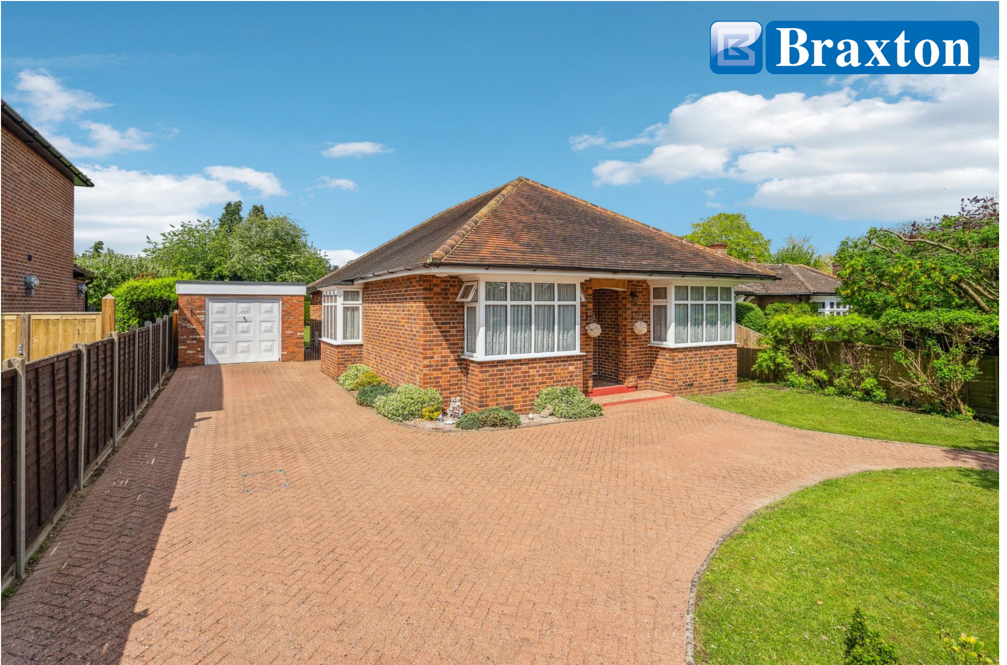
22 Camley Gardens, Maidenhead, Berkshire SL6 5JW