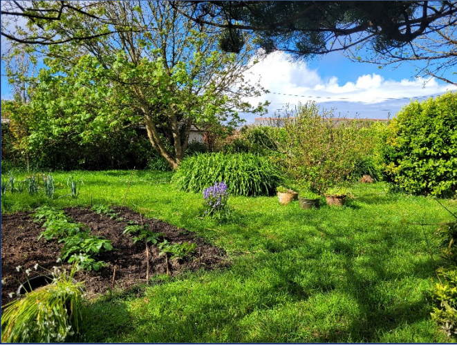
Individual building plot | Central village location | Proposed 3 bedroom detached house

A rare opportunity to purchase an individual building plot in the heart of The Lizard village. Detailed planning consent for a three bedroom detached house with detached garage, parking and gardens.