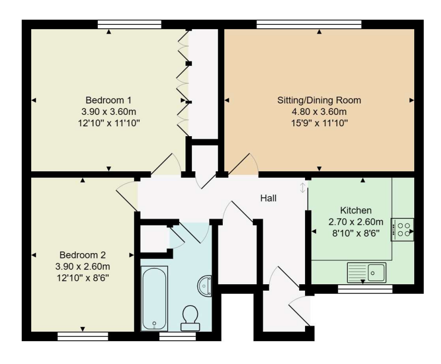
Total Area: approximately 69.3 m<sup>2</sup> ... 746 ft<sup>2</sup> All measurements are approximate and for display purposes only.