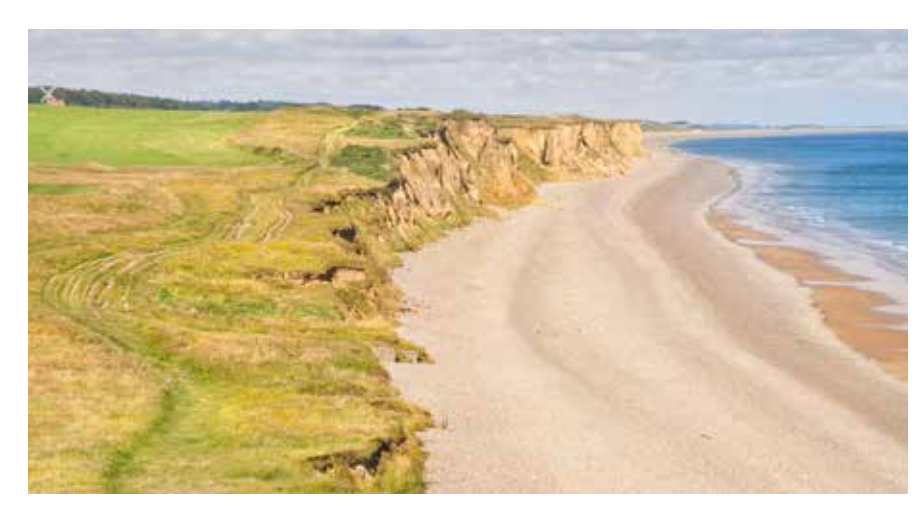
Sheringham clifftops and beach.

Take the coastal path west towards pretty Cley and Salthouse Marshes or head east back to Sheringham. Surrounded by fields, woodland and heathland in an Area of Outstanding Natural Beauty, with its village shop, tea room, many traditional cottages and period homes this is a wonderful place to call home.