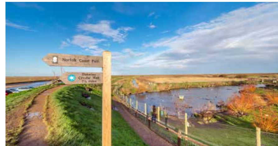
Norfolk Coastal Path, at Blakeney

“Blakeney is beautifully situated on the coastal path, ensuring wonderful walks in either direction.”