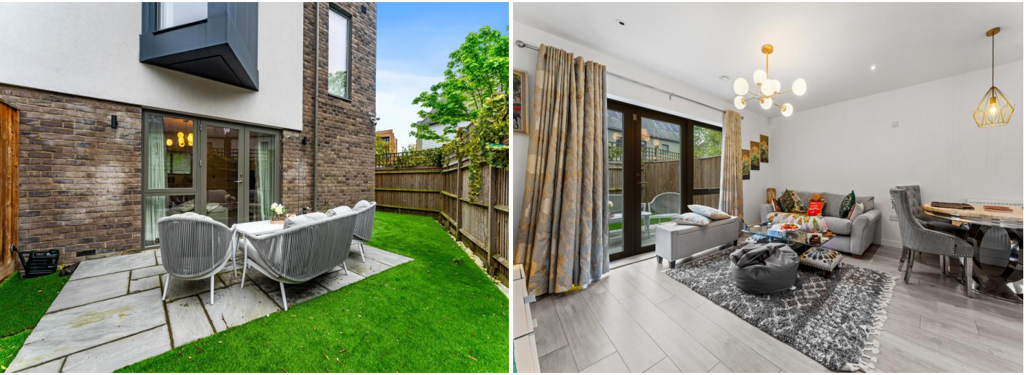
1 Corbet Close, Hackbridge, Wallington, Surrey, SM6 7GB | £495,000 Freehold

This immaculately presented 3 year old Rydon Homes end of terrace house is situated within a short walk of a range of shops, schools and station. The accommodation boasts an open plan ground floor with a fully fitted kitchen/lounge/dining area which has doors out to the garden. The first floor has two double bedrooms and a beautiful family bathroom. Other benefits include allocated parking and low maintenance garden.