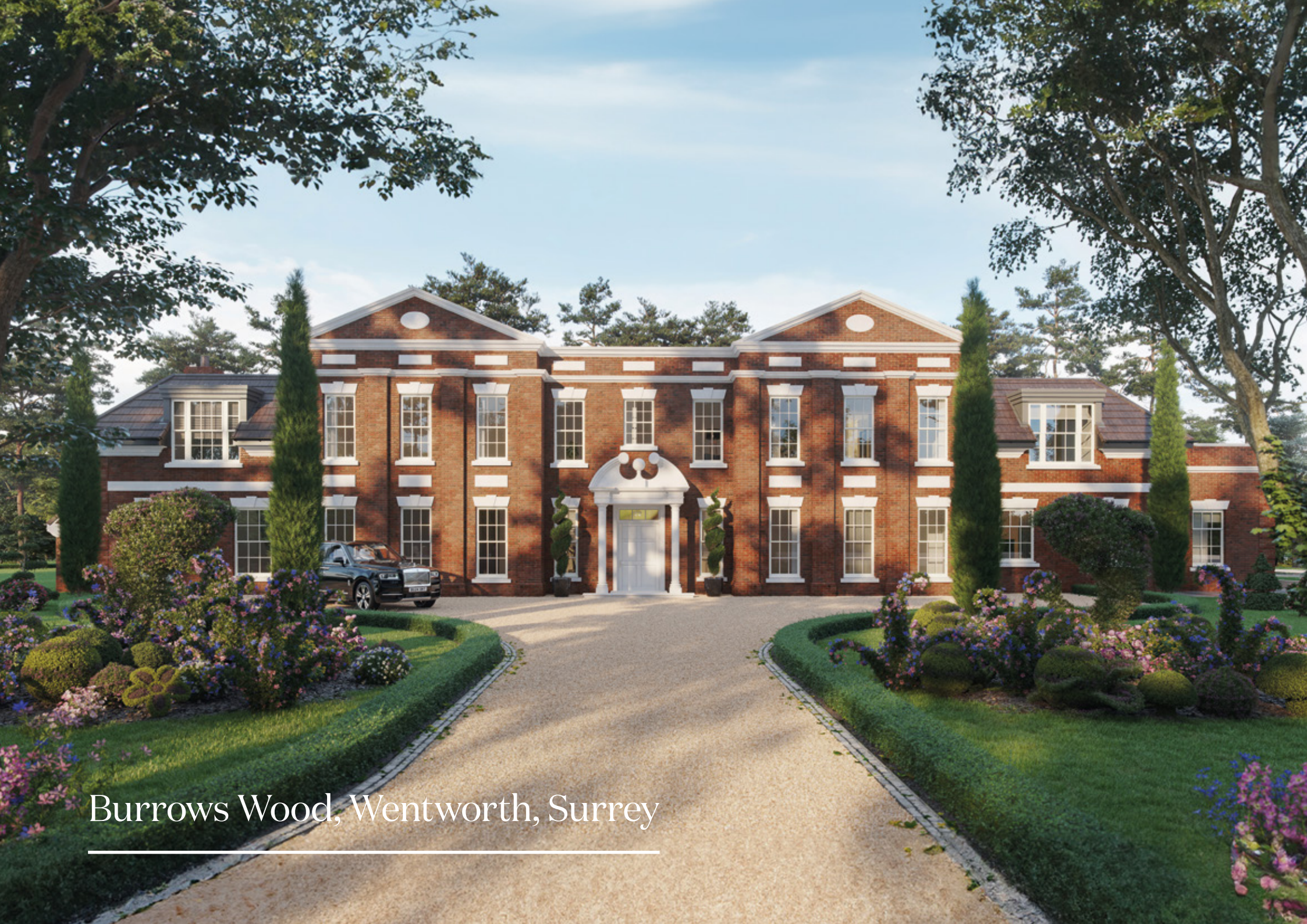
Burrows Wood, Wentworth, Surrey