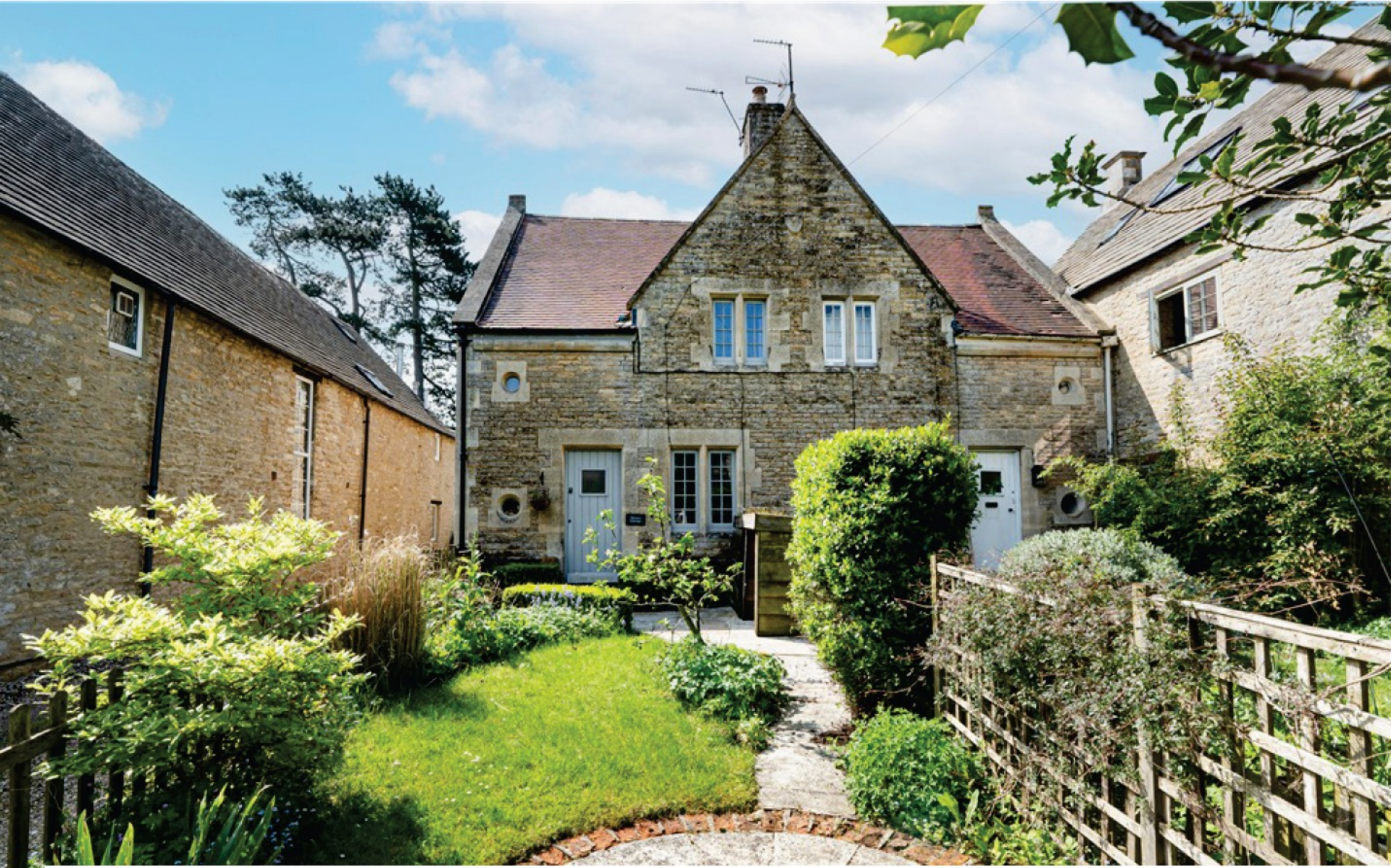
Torness Cottage, Ramsden