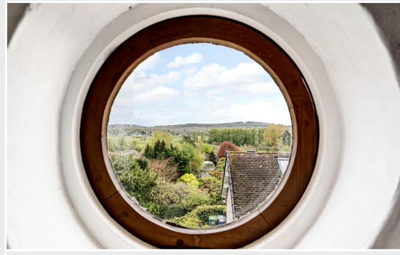
Views from Bedroom Two