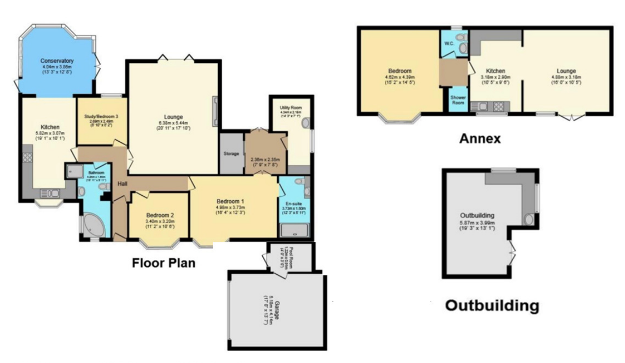
Total floor area 255.3 sq. m. (2,748 sq. ft.) approx