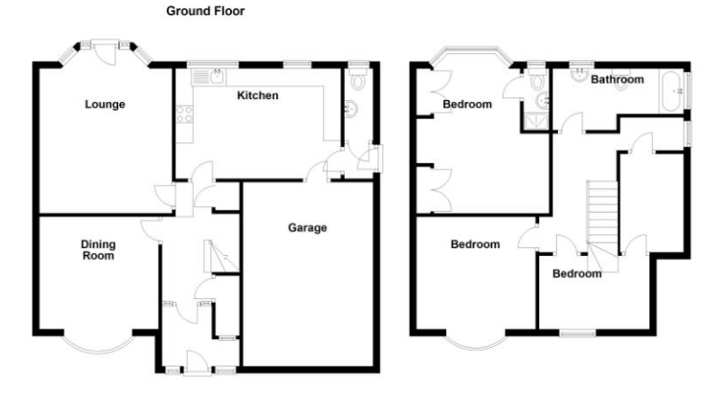
Total area: approx. 135.2 sq. metres (1455.0 sq. feet)