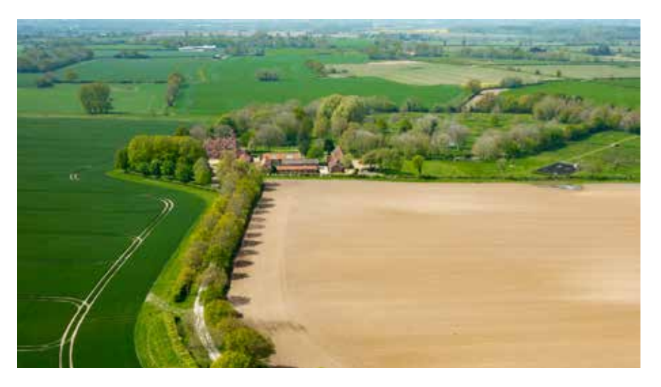
Wood Dalling Hall and grounds that surround.

"Lush greenery and tranquil surroundings create an idyllic backdrop..."