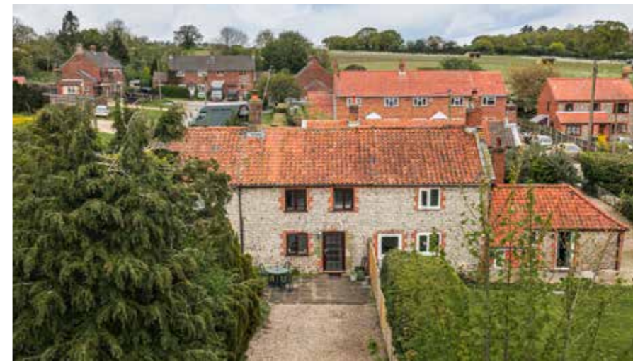
47 Holt Road and surrounding area.

“A tranquil escape from the hustle and bustle.”