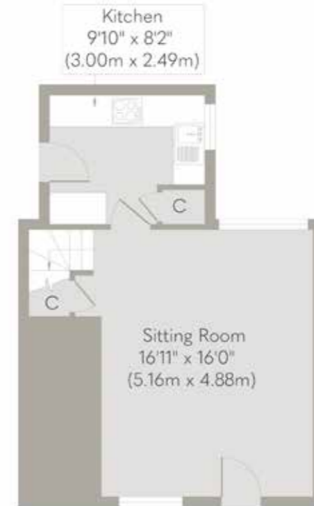
Ground Floor Approximate Floor Area 336 sq. ft (31.18 sq. m)

Whilst every attempt has been made to ensure the accuracy of the floor plan contained here, measurements of doors, windows, rooms and any other items are approximate and no responsibility is taken for any error, omission, or mis-statement. This plan is for illustrative purposes only and should be used as such by any prospective purchaser or tenant. The services, systems and appliances shown have not been tested and no guarantee as to their operability or efficiency can be given.