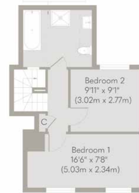
First Floor Approximate Floor Area 362 sq. ft (33.60 sq. m)