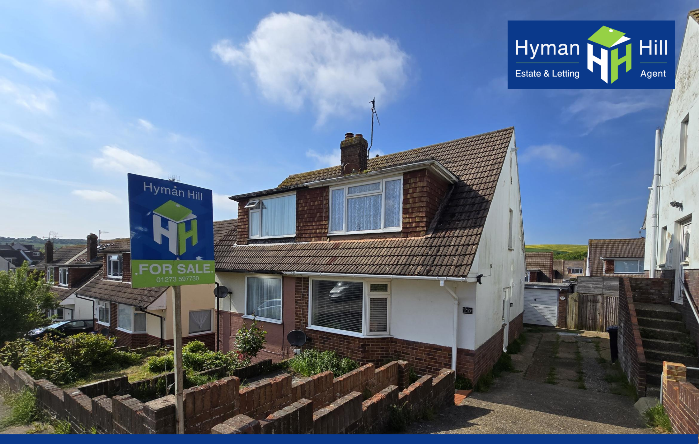
29 Graham Crescent, Portslade, East Sussex, BN41 2YA