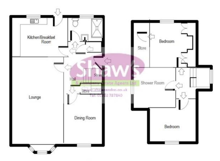
Whilst every attempt has been made to ensure the accuracy of the floor plan contained here, measurements of doors, windows, rooms and any other items are approximate and no responsibility is taken for any error, omission, or mis-statement and the floor plan is an illustration only as a guide. This plan is for illustrative purposes only and should be used as such by any prospective purchaser or tenant. The services, systems, appliances, shown have not been tested and no guarantee as to their operation or efficiency can be given Made with Visual Builder