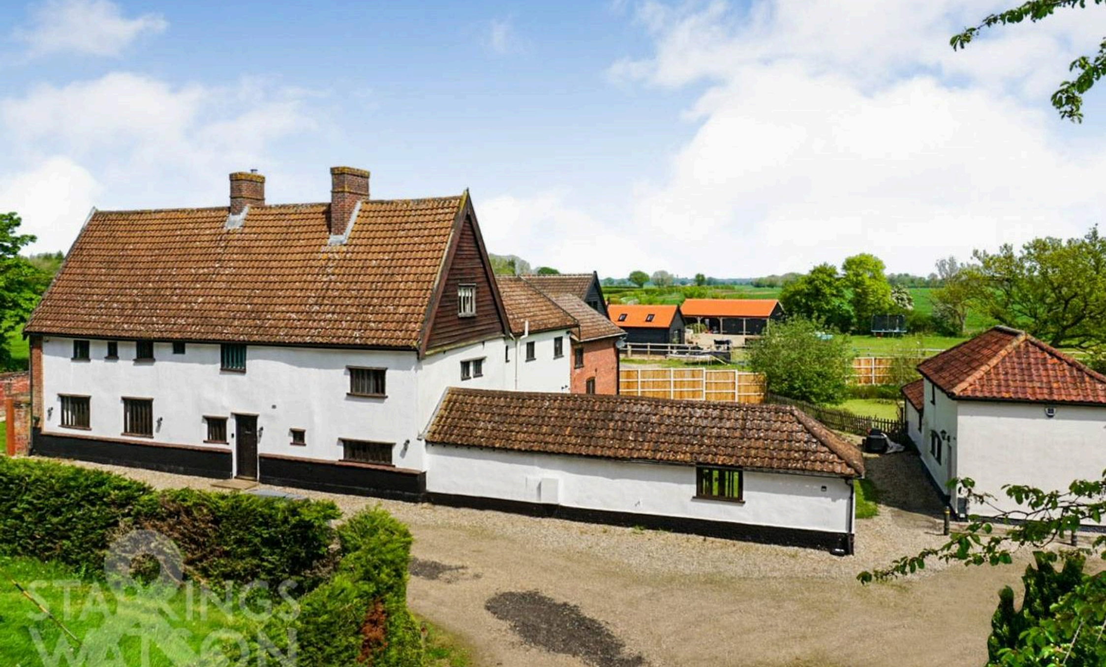
Long Row, Tibenham - NR16 1NZ