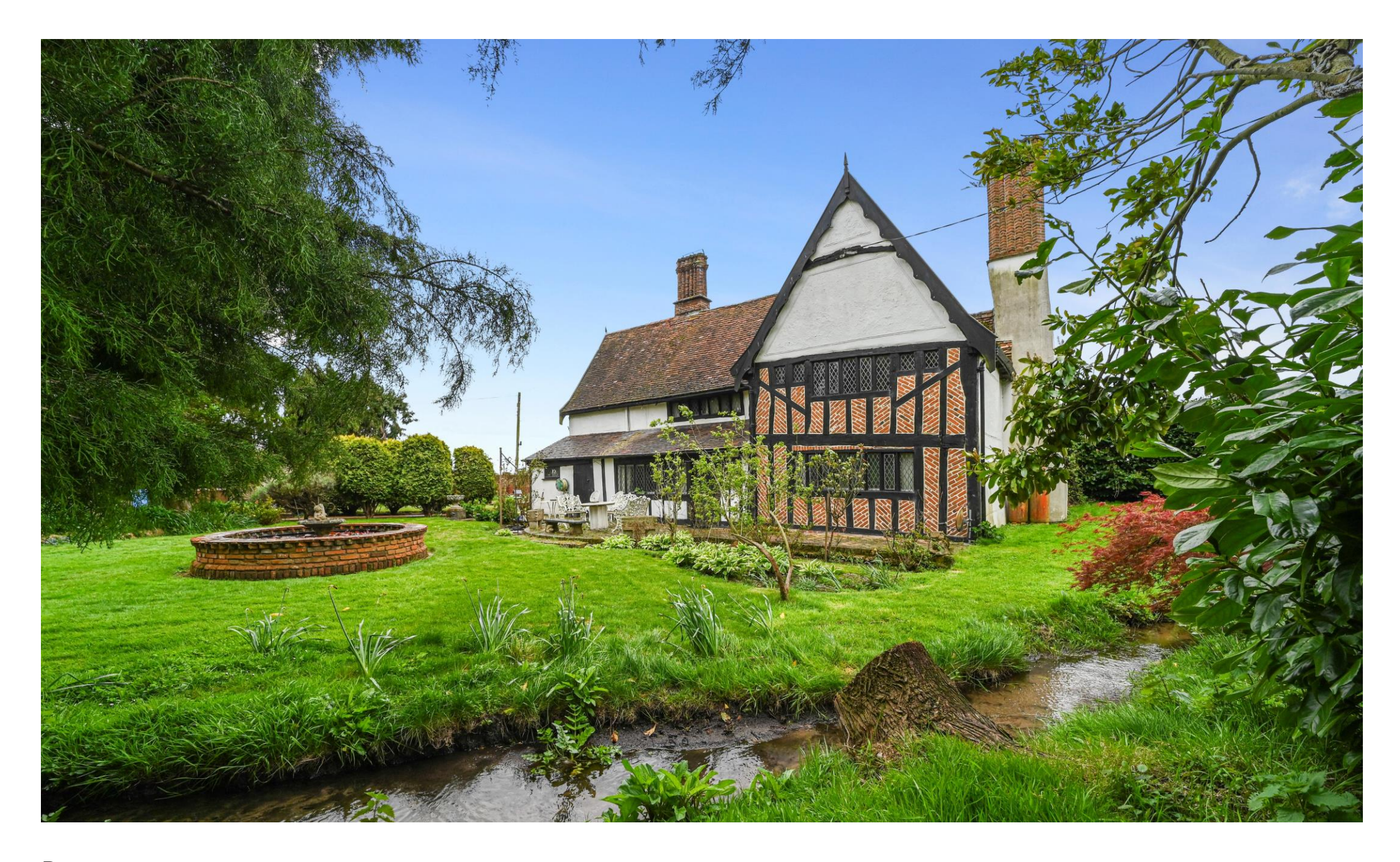
Ravenys Dedham Road | Stratford St. Mary | CO7 6LT