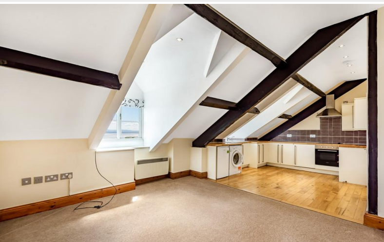
Open Plan Living Area/Kitchen