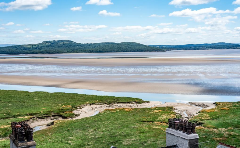
View to Morecambe Bay