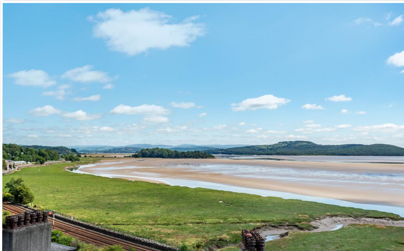
View to Morecambe Bay