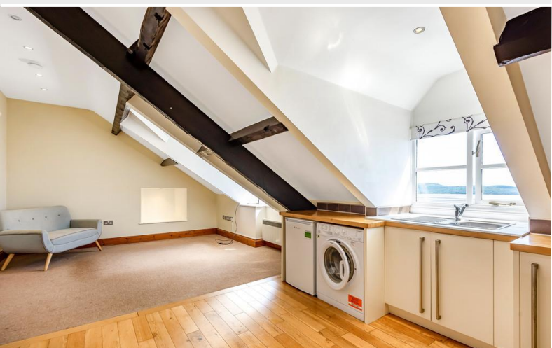
Open Plan Living Area/Kitchen

Description Flat 3 Myrtle Court is a super, spacious and light Second Floor Apartment with a modern 'lofty' feel, exposed beams, well thought out layout, spacious rooms, excellent central location and magnificent far-reaching views towards Morecambe Bay and the coastline and fells beyond. This property will appeal to Investors, those seeking a bolt-hole or perhaps a First Time Buyer.