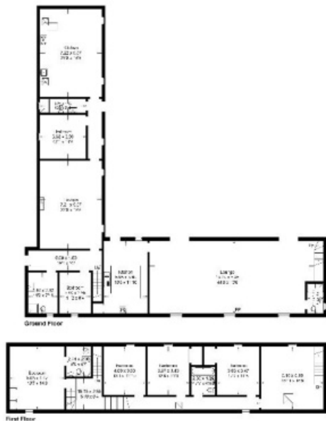
Illustration for identification purposes only, measurements are approximate, not to scale. floorplans4sketch.com © (ID1076220)

Approximate Gross Internal Area = 370.2 sq m / 3985 sq ft