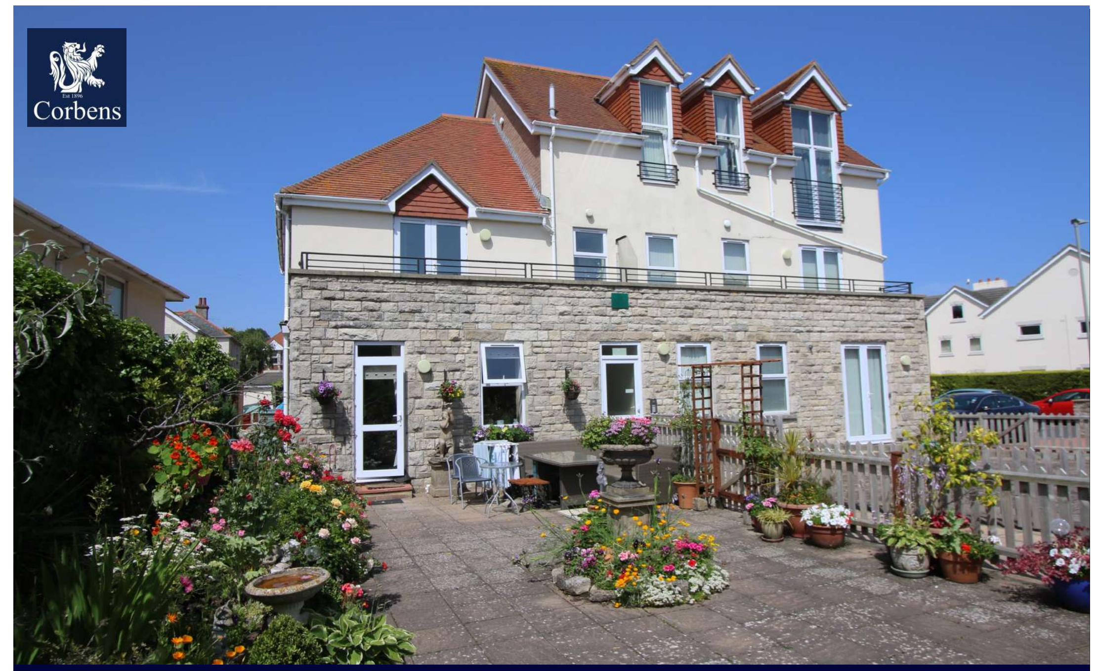
FLAT 1 THE ASPENS, NORTHBROOK ROAD, SWANAGE £275,000 LEASEHOLD