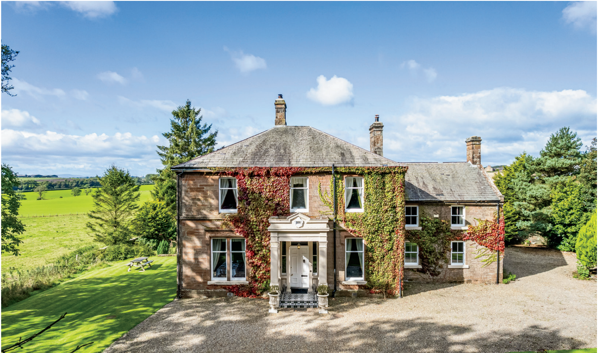
Berryburn Kirkpatrick Fleming | Lockerbie | Dumfriesshire | DG11 3NH