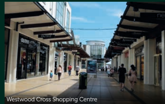
Westwood Cross Shopping Centre

This attractive selection of 2, 3 and 4 bedroom homes is perfectly positioned to provide the best of the countryside and the coastline, with all the modern comforts nearby.