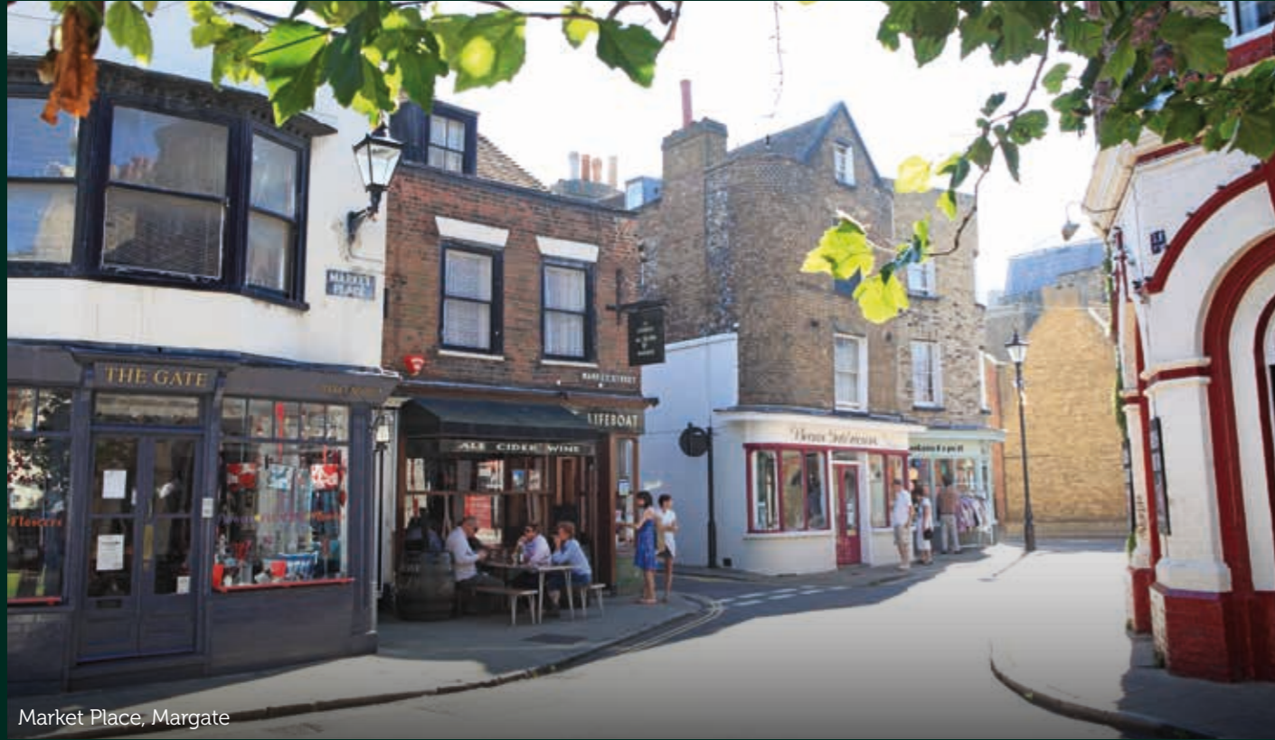
Market Place, Margate