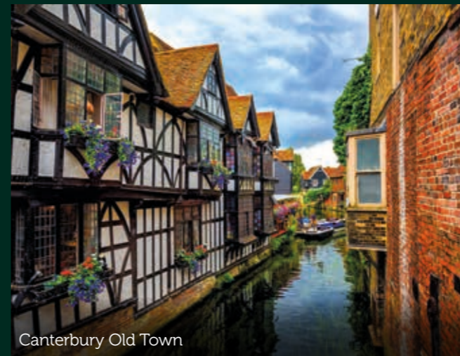
Canterbury Old Town