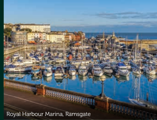
Royal Harbour Marina, Ramsgate