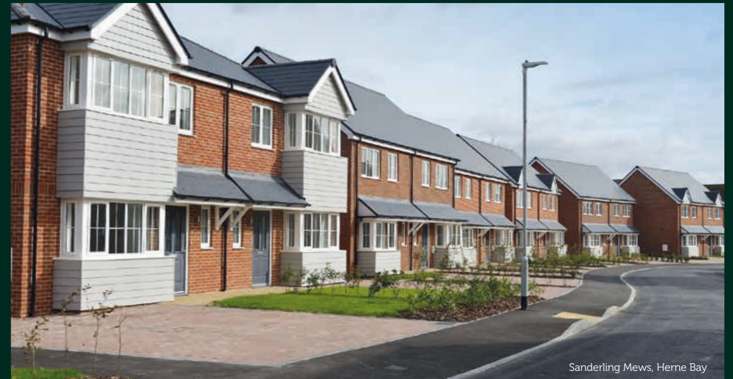
Sanderling Mews, Herne Bay