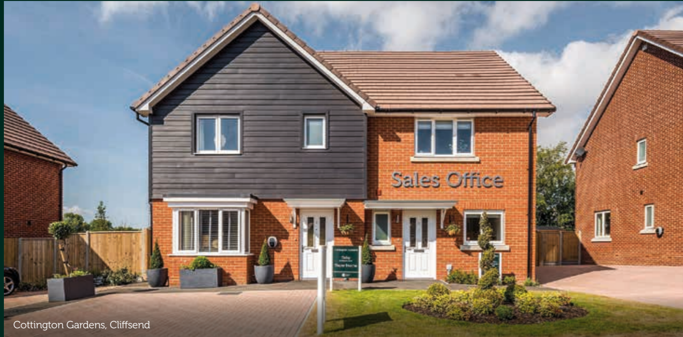
Cottington Gardens, Clifsend