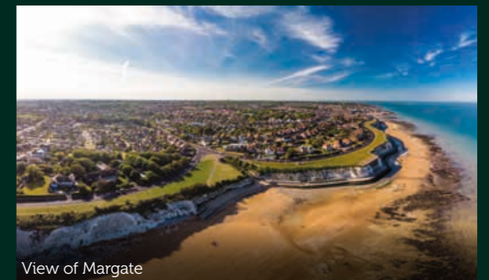
View of Margate

Alternatively, if you need to get away from it all, there is a wealth of beautiful local countryside and coastline to explore. The 32-mile Viking Coastal Trail provides the perfect outing if you are feeling energetic. Alternatively take a leisurely drive around the countless picturesque surrounding villages to absorb the area's vast local history and charm.