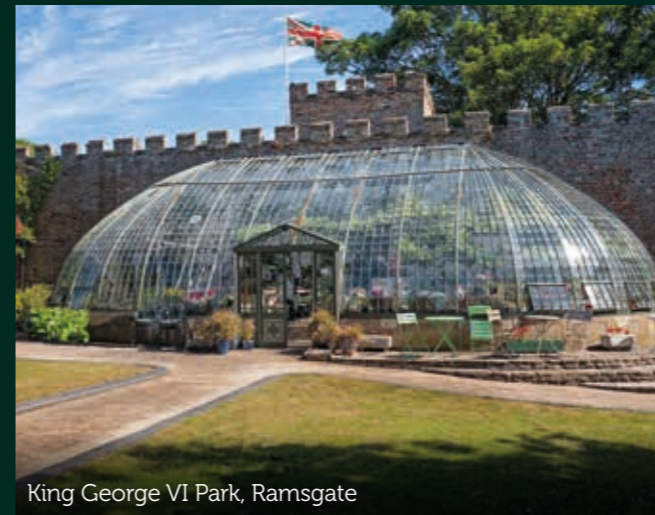
King George VI Park, Ramsgate