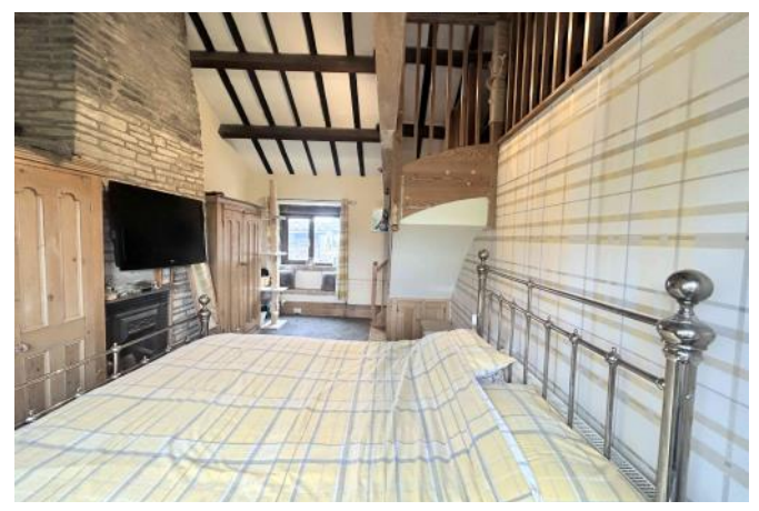
MEZZANINE/OFFICE 3.8 x 2.8m (9'4 x 12'7)