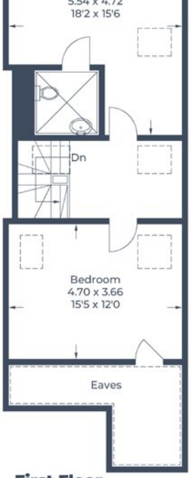
Illustration for identification purposes only, measurements are approximate, not to scale. © CJ Property Marketing Produced for Robsons