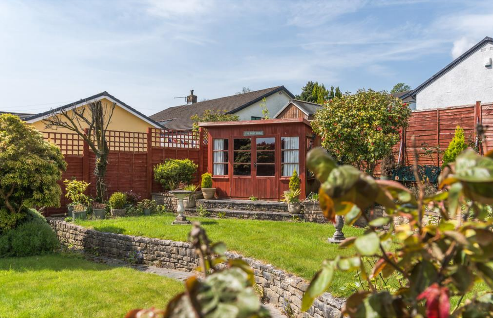
Rear Garden and Summerhouse