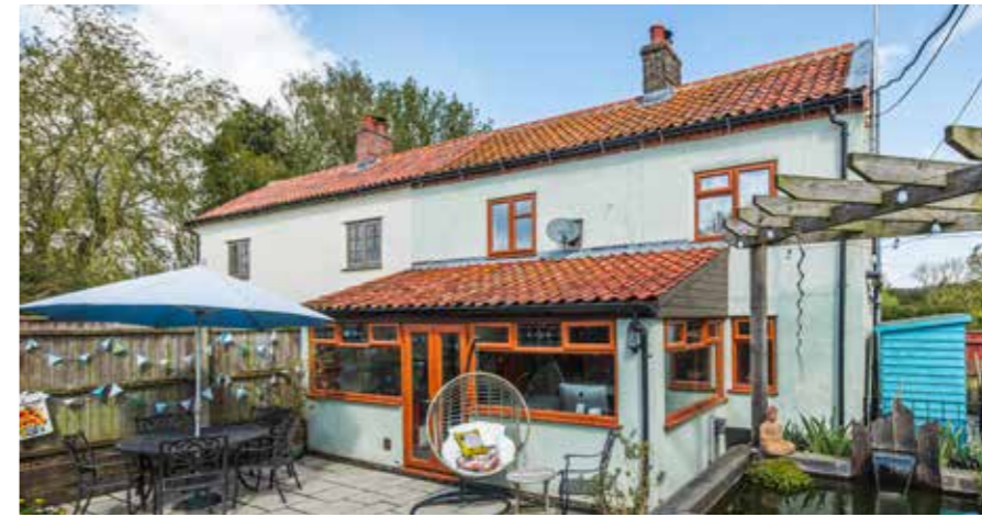
South facing garden of Standen Cottage

"we have such a lovely view over the fields..."