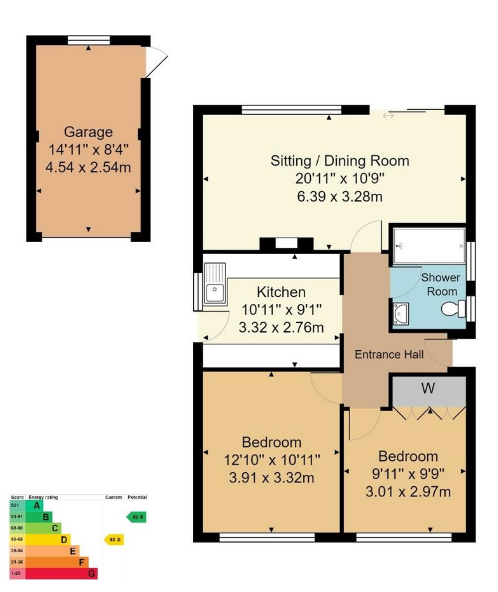
Bungalow Approx. Gross Internal Area 695 sq. ft / 64.5 sq. m Garage Approx. Internal Area 124 sq. ft / 11.5 sq. m

Whilst every attempt has been made to ensure the accuracy of the floor plan contained here, measurements of doors, windows, rooms and any other items are approximate and no responsibility is taken for any error, omission, or mis-statement. This plan is for illustrative purposes only and should be used as such by any prospective purchaser or tenant. The services, systems and appliances shown have not been tested and no guarantee as to their operability or efficiency can be given.